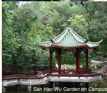
San Hao Wu Garden on Campus