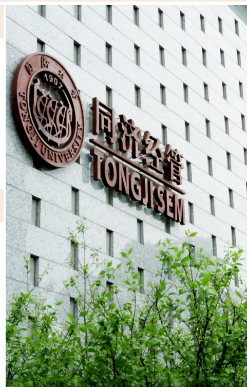
Tongji Building A